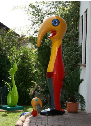
Haptikuss - 2 layers of acrylic paint + 2 layers of glossy varnish - Silvia Baumer

ATTENTION: Apply finishing products only on perfectly dry items (minimum 72 hours drying) in order to avoid blister problems.