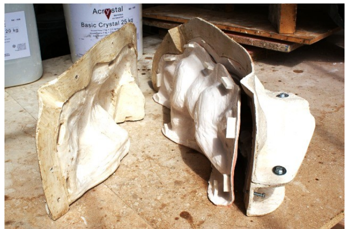
Fine mould case - Frédéric Vincent

Acrystal Prima is the ideal product for the production of light mould cases. The absence of shrinkage avoids the deformations of the mould cases during drying. Therefore it's not necessary to provide metal reinforcements even for large size mould cases.