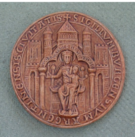
Sceau - Marc Toillié

For the moulding of parts with very fine sections (a few millimetres), it is possible to reduce the mixing ratio of Acrystal Prima from 1 to 2,5 to :