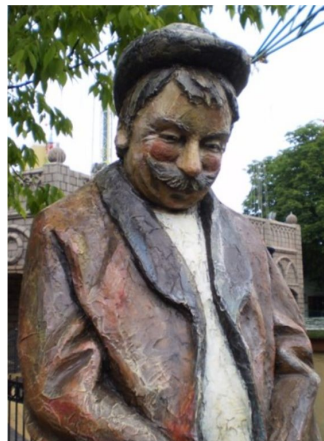
Figure - 2 layer Acrystal Finition - Prater - Vienna - Roland Zojer (Fasching)

ATTENTION: Acrystal Prima is resistant to bad weather, but can not be immersed or splashed continuously. In case of extended contact with water you can either: