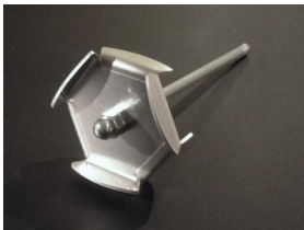
Acrystal mixing whisk

Use a high shear mixing blade at a mixing speed over 700 rpm in order to create a vortex and to break up small lumps.